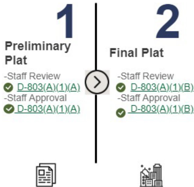
Table 8A – Overview of Process for Developments that Require a Minor Subdivision (Typical, Applicant Coordinates Submittals)

Section D-809. Summary Tables. For ease of reference, the following Tables summarize the review and approval process when property is subdivided.