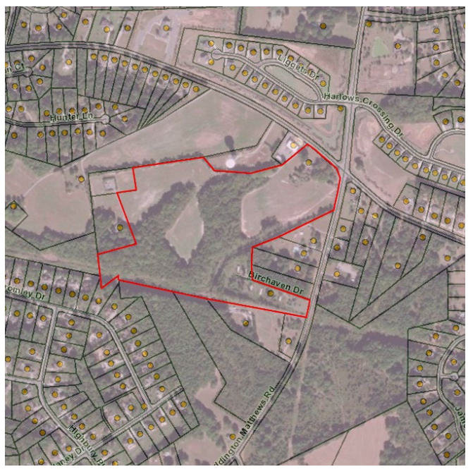
Figure 1 - Aerial

On March 22, 2021, the Planning Board reviewed a new preliminary plat and expressed concerns over runoff into the Bromley subdivision and whether any downstream studies were completed. The Board discussed whether additional right-of-way was needed for future improvements at the intersection of Hemby and Weddington-Matthews Roads.