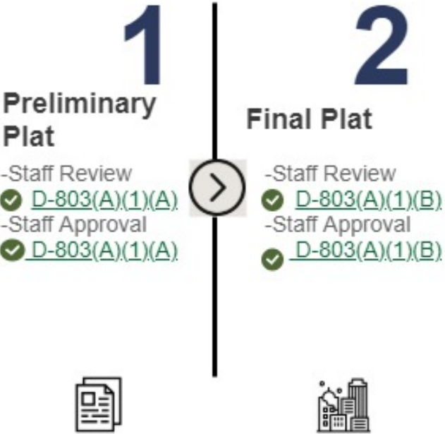
Table 8A – Overview of process for developments that require a Minor Subdivision (typical, applicant coordinates submittals)