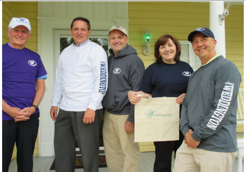
The Council would like to wish you a